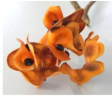
Pararchidendron pruinosum - the Snow Wood seed pod

Snow Wood, a small attractive tree with light green leaves derives its name from the white-ish "powder" on its foliage. It once grew on the margin of rainforests. If you give it shelter from the cold sou-westerlies of our district, Snow Wood will flourish even in full sun. It grows out in the open upon Richmond Hill and is a heavy seeder beside Caroona - Marima Nursing Home in Goonellabah. It is not tolerant of