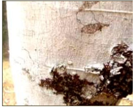
The fine light grey bark on young tree develops deep, rough fissures as the tree matures.

It is an excellent tree for farm forestry producing a soft, straight and fine-grained red timber that takes a high polish. It has been used for plywood, furniture, cabinetwork and veneer.