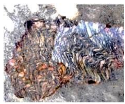
Polished face of rock revealing its underlying pattern and colour

signs, ranged along an avenue some 8 metres wide by 50 metres long. Each sign contains a description of chemical composition, geological origins, a distribution map, and a photographic enlargement of the crystalline structure of each rock. Each boulder has a cut and polished face showing the brilliant textures and colours of that rock type. The Prague Geopark is an