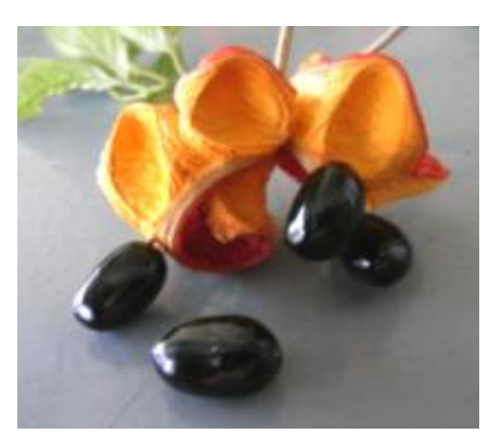
... and its close cousin Archidendron grandiflorum, Veiny Lace Flower pod.

heavy frosts. The Gardens Nursery has planted further seeds of Snow Wood and expects a fast germination.