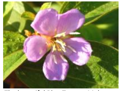
The beautiful Blue Tongue Melastoma affine flower