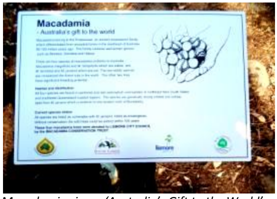
Macadamia sign - 'Australia's Gift to the World'

The first is Macadamia tetraphylla , or the NSW bush nut. Tetraphylla has four leaves at each whorl – the other three species all have three leaves at each whorl.