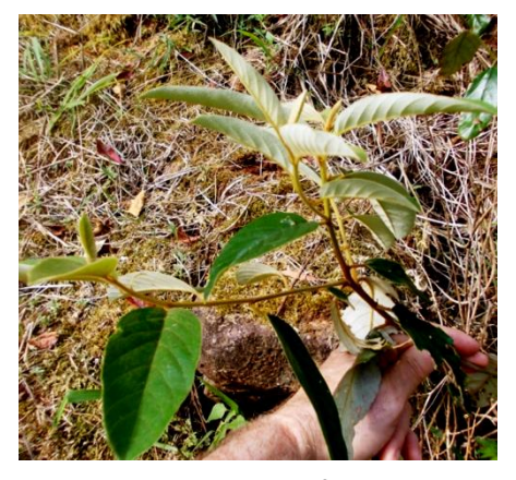
New growth showing the finely hairy underside of leaves, fine golden brown fur on branchlets and typical caterpillar damage

While generally a small to medium sized tree, it is a highly diverse species often occurring as a large shrub in forest on poorer soils, it can grow up to 35 m or more. Floyd gives the dimensions of one exceptionally large tree in Koreelah State Forest as 42 m in height and 116 cm in diameter.