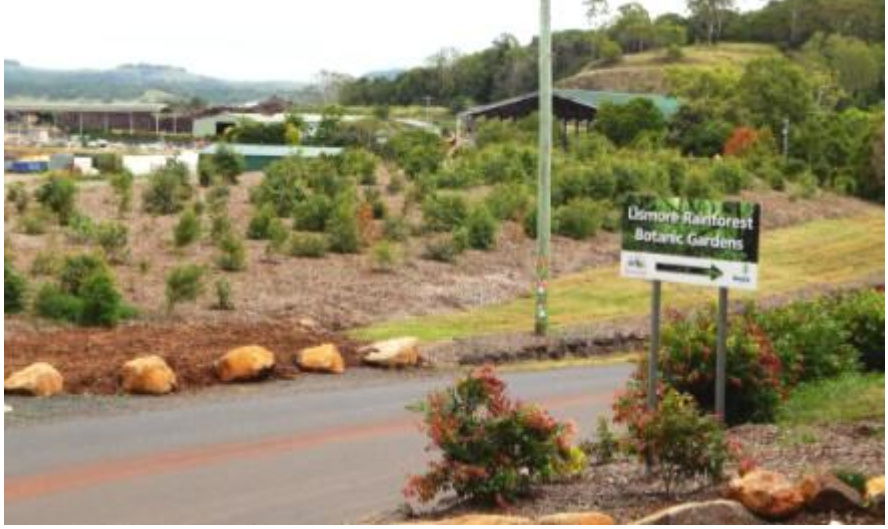
Recent phytocapping planting viewed from Botanic Gardens entrance with operational area of Lismore Recycle and Recovery Centre in the background

From Submission by Kevin Trustum to the Waste 2014 Conference, scheduled for Coffs Harbour, later this year.