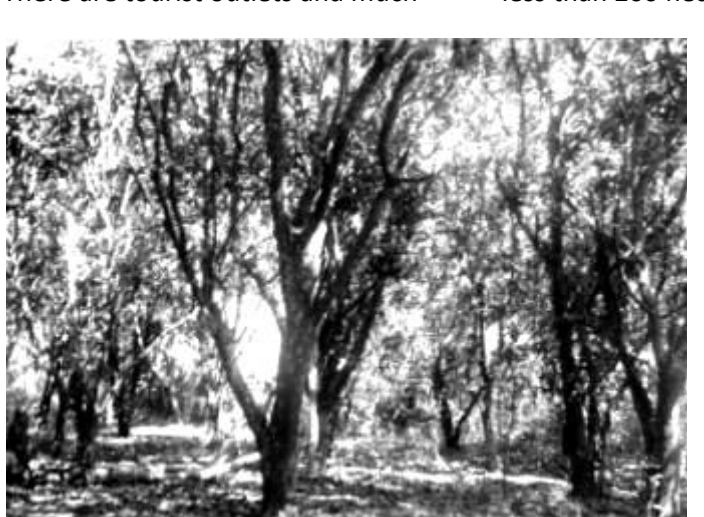
The first commercial orchard in the world planted in the 1880's at Rous Mill.

The hills around Lismore and much of the Northern Rivers are now covered with over two million trees in about 300 orchards. There are many processing factories including the world's largest at Alphadale. There are tourist outlets and much