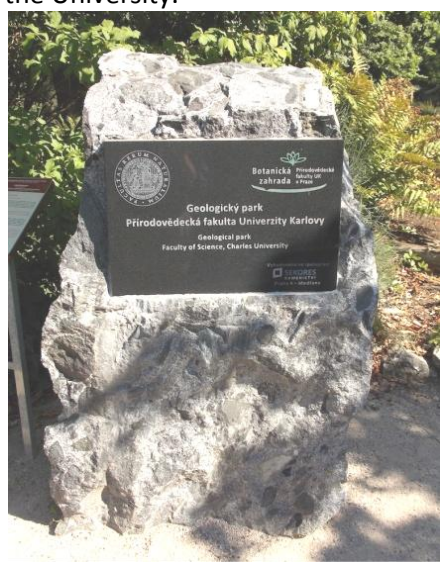
This sign recognises the contribution of the Science Faculty of Charles University

Both gardens maintain close links with the Science Faculty of Univerzity Karlovy (Charles University), and the Albertov gardens boast a unique "Geological Park" developed in cooperation with the University.